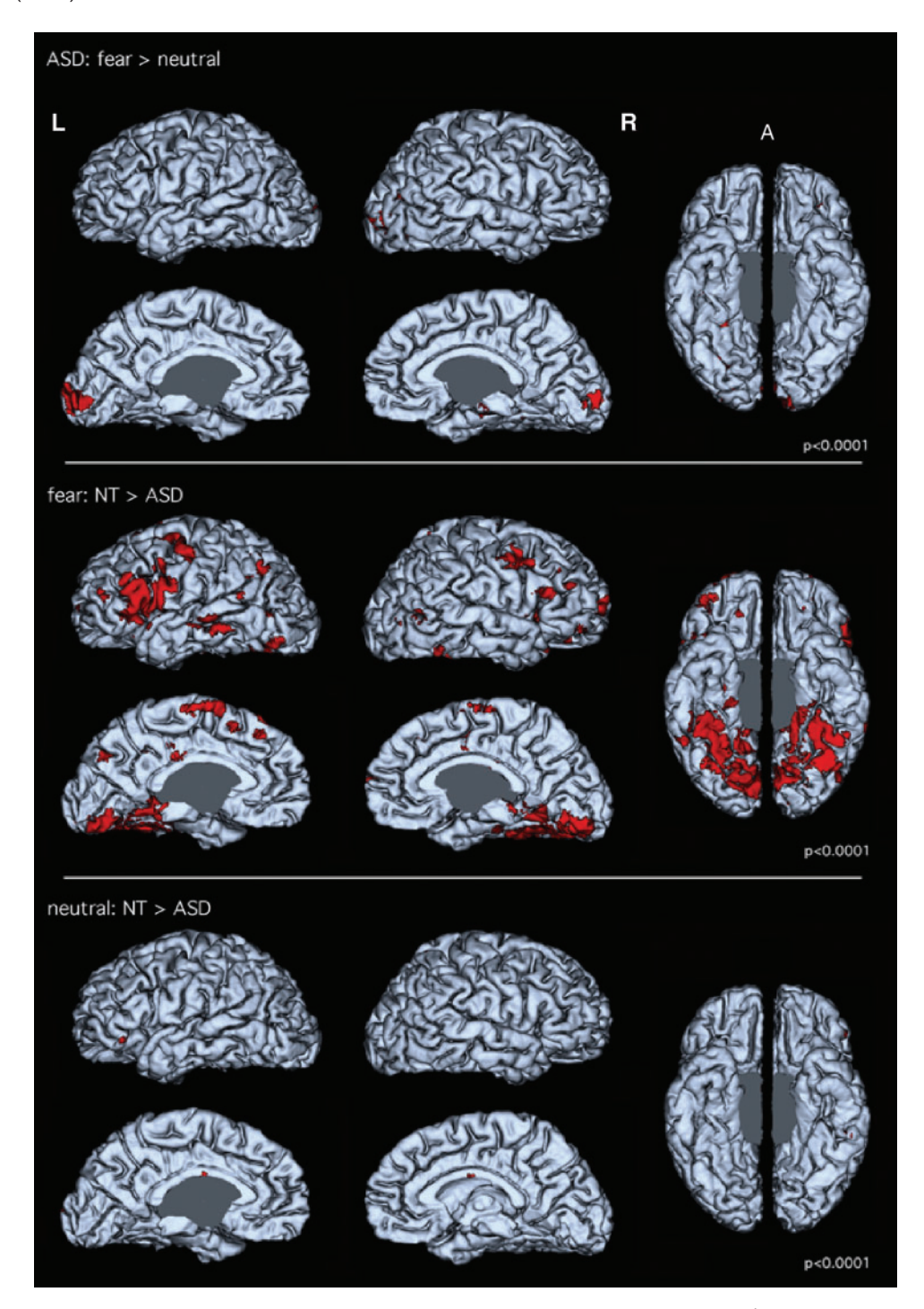
Fig. 2 Lateral, medial and ventral view of 3D reconstructions of a brain. Red indicates areas of significant differences ( P < 10^{-4} ) between conditions (top panel) or between groups (middle and bottom panels). Top panel shows differential activation between Fearful and Neutral condition in the ASD group. Only the striate and extrastriate visual cortex show differential activation. The middle panel shows differential activation between NTs and ASD participants for the fear condition. NT participants show significantly more activation than ASD in the inferior frontal, motor, premotor, temporal and ventro occipito—temporal cortices. The bottom panel shows differential activation between NTs and ASD participants for the neutral condition. Contrary to what is seen for the emotional condition, very little difference is seen, with the presence of more activation for neutral stimuli in NT present in IFC and anterior insula only, ruling out an attentional effect in the results seen in the middle panel.

emotional contagion was absent in ASD participants in the present study.